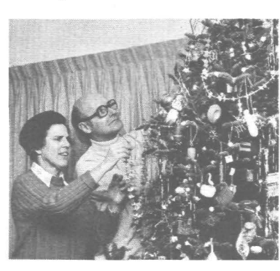
Xmas story P/3

The television commercial features a mechanical device with scrub brushes using Sno-Bol and other brands to clean stained porcelain. The Sno-Bol liquid cleaning time is dramatically shorter than the other brands.