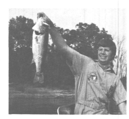
Fish story P/4